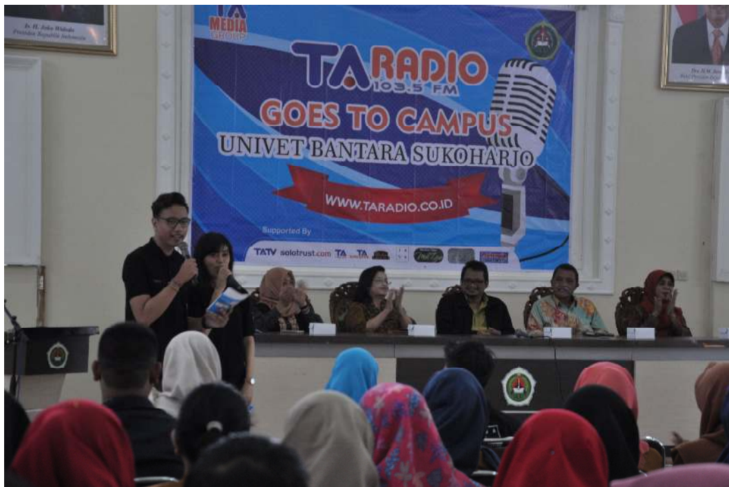
3.Event Hari Valentine